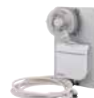
Pressure switch CI79 Art. nr. 116102