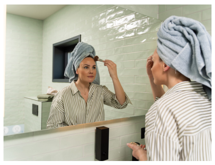
On average, we spend 58 years of our lives at home, and as much as 27 years in the bedroom, so the air in housing is important.