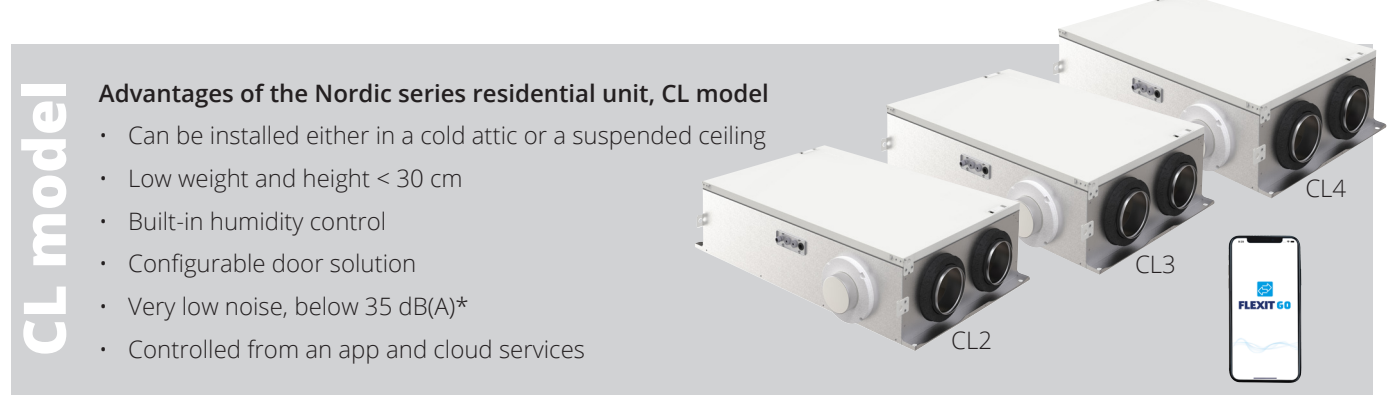
*Noise to surroundings at 4 dB room attenuation, corresponding to 10m<sup>2</sup> Sabine.