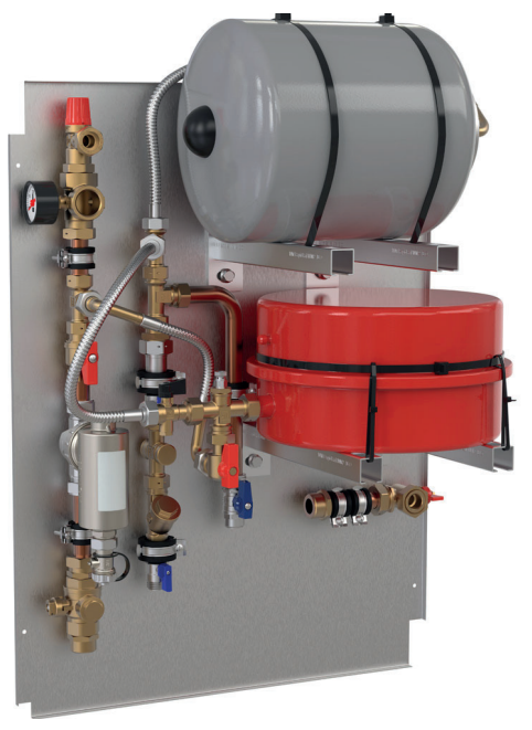
Prefab module with expansion tank for domestic water

Prefab module adapted for installation in the EcoNordic WH4 installation module, which produces a simple, elegant and cost-effective and installation.