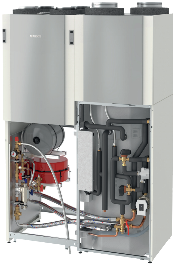
EcoNordic with prefab module installed and kit with expansion tank for domestic water