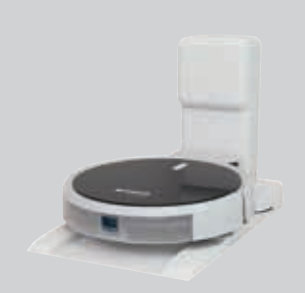
cvROBO is suitable for smaller homes where there are easy accessibility and not too large area too be cleaned.

Flexit supplies systems for a better indoor climate. Flexit is a market leader in residential ventilation and has provided ventilation systems to homes for over 40 years. Our systems are specially designed to improve the indoor climate in houses, in demanding conditions. So you can rest easy!