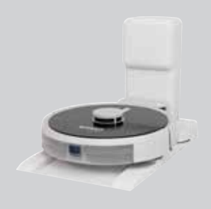
cvROBO L1 suits most residential housing. Handles challenging rooms with more difficult access. Passes obstacles easily. Better suction power. Provides great opportunity for control and programming.